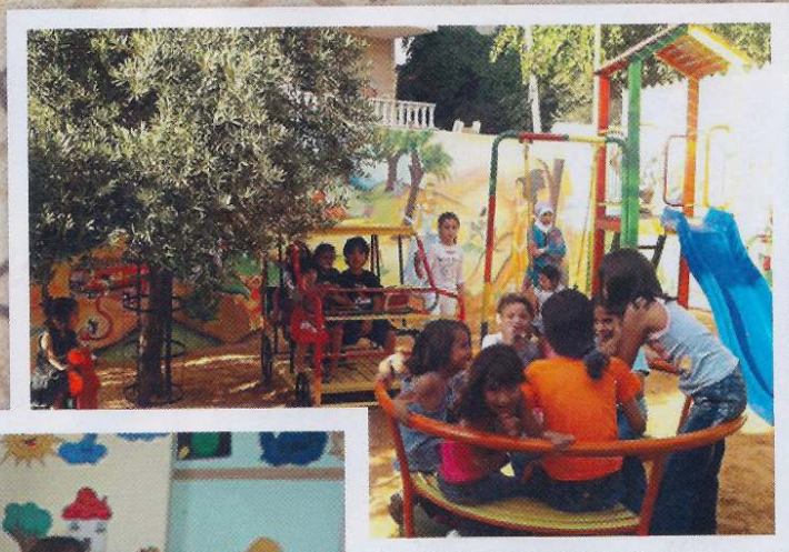
▲ School children on the playground of kindergarten in Jerusalem.